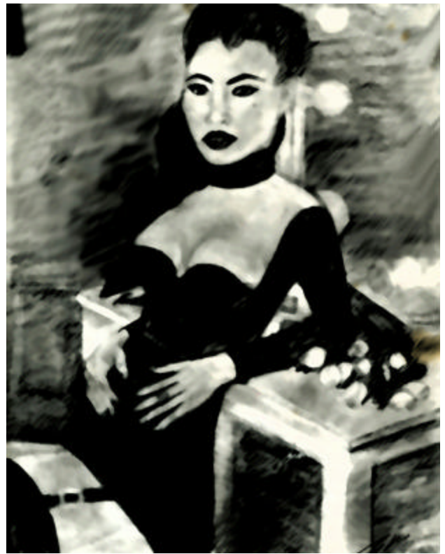
Mirror , 2002. Digital lead, matte finish on foam board. 18 x 24. $100. 10 signed and numbered copies available.

— the horrific devastation of sexuality. (alluring, vacuous sores . . . aren't we all . . .)