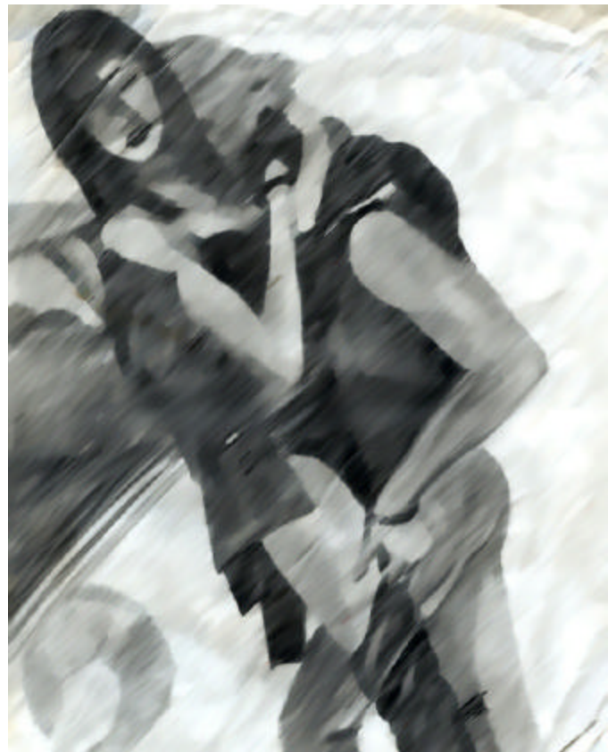
StaticToil , 2001. Digital lead, matte finish on foam board. 18 x 24. $100. 10 signed and numbered copies available.

— to feel crippling jealousy and rage, when you witness an artist who moves you in such a way.