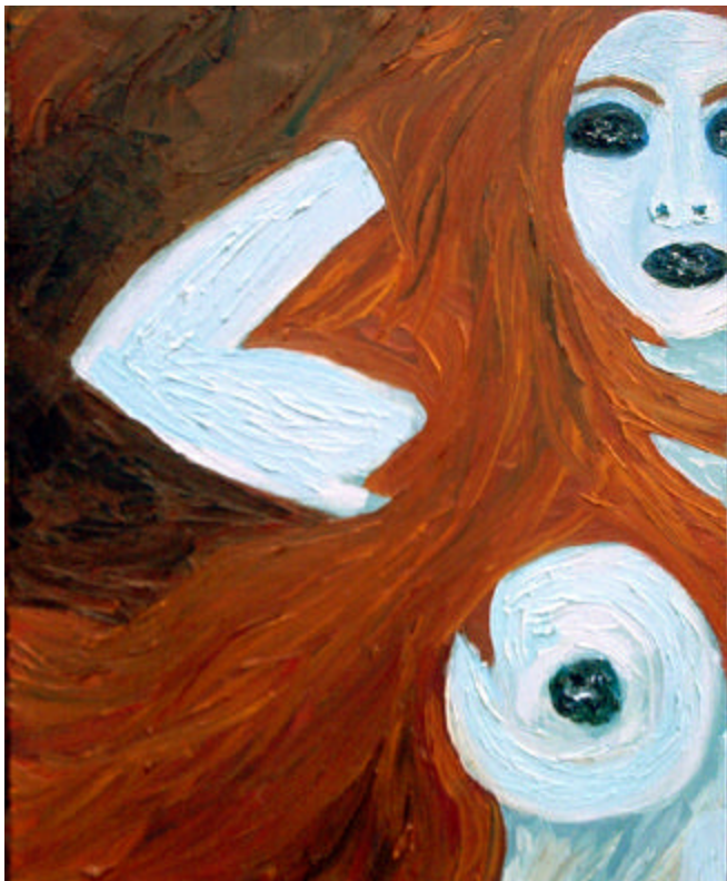
ObSess , 2002. Oil on canvas (textured for dim lighting). 16 x 20. $250.

— the horrific devastation of sexuality. (alluring, vacuous sores . . . aren't we all . . .)