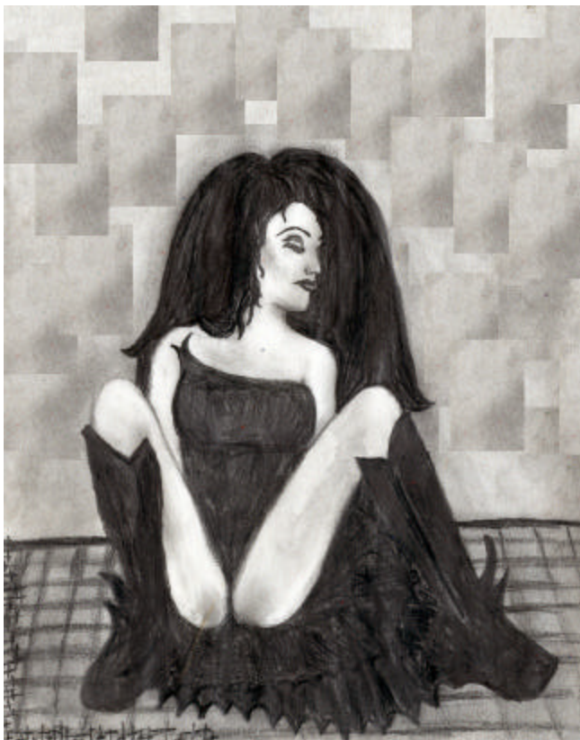
FloorShow , 2001. Digital lead, matte finish on foam board. 18 x 24. $100. 10 signed and numbered copies available.

— when stage fright prevails over the burning desire to be known. (and into the mirror you keep staring and staring)