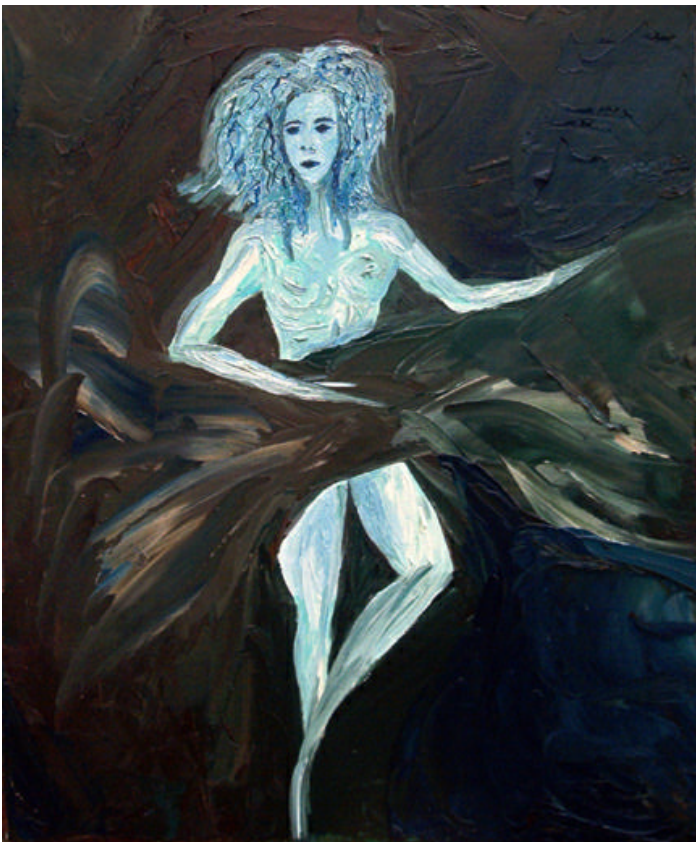
Decay , 2002. Oil on canvas. 16 x 20. $250.

— the idiom for post modern dame. there is beauty in being lame.