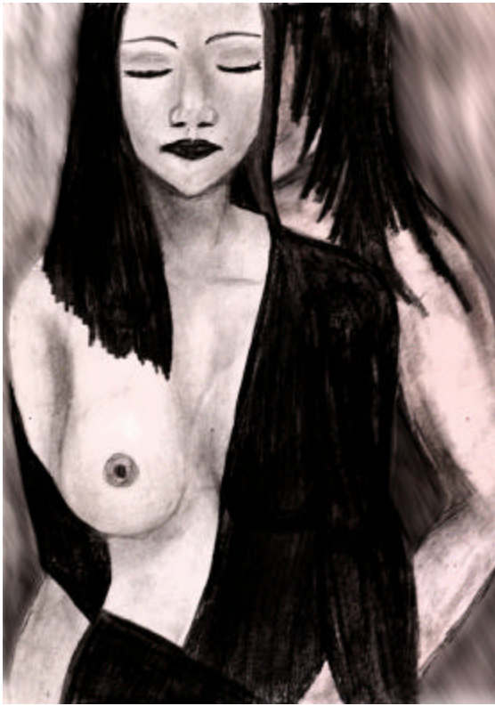
Barren , 2002. Digital lead, matte finish on foam board. 18 x 24. $100. 10 signed and numbered copies available.

— when you lack the skill and fade away.