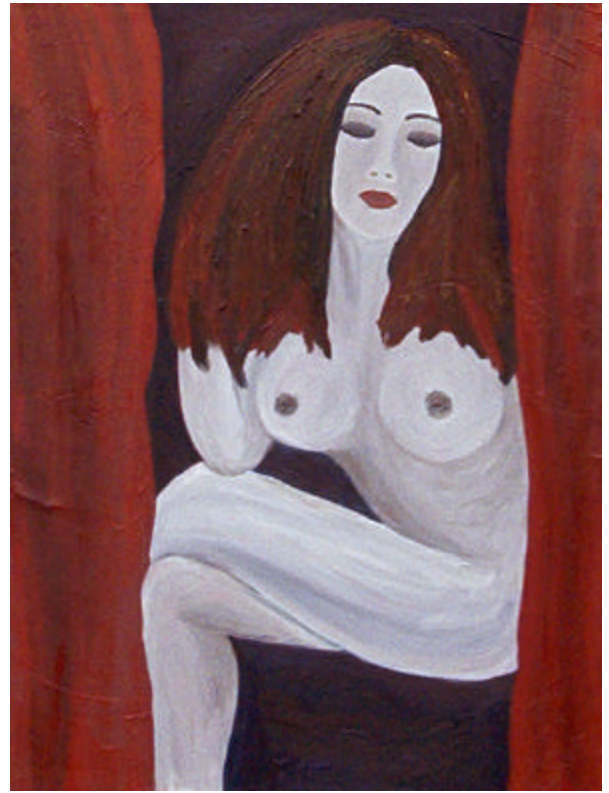
Epitome , 2002. Oil on canvas. 30 x 40. $500.

— when you lack the skill and fade away.